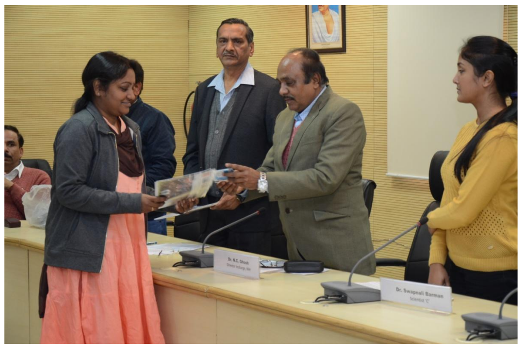
Participant Receiving Certificate of the Training Programme on Water Quality Monitoring of Surface, Ground, Waste Water / Effluent, Data Interpretation and Quality Assurance 11-13 Feb. 2019, Roorkee