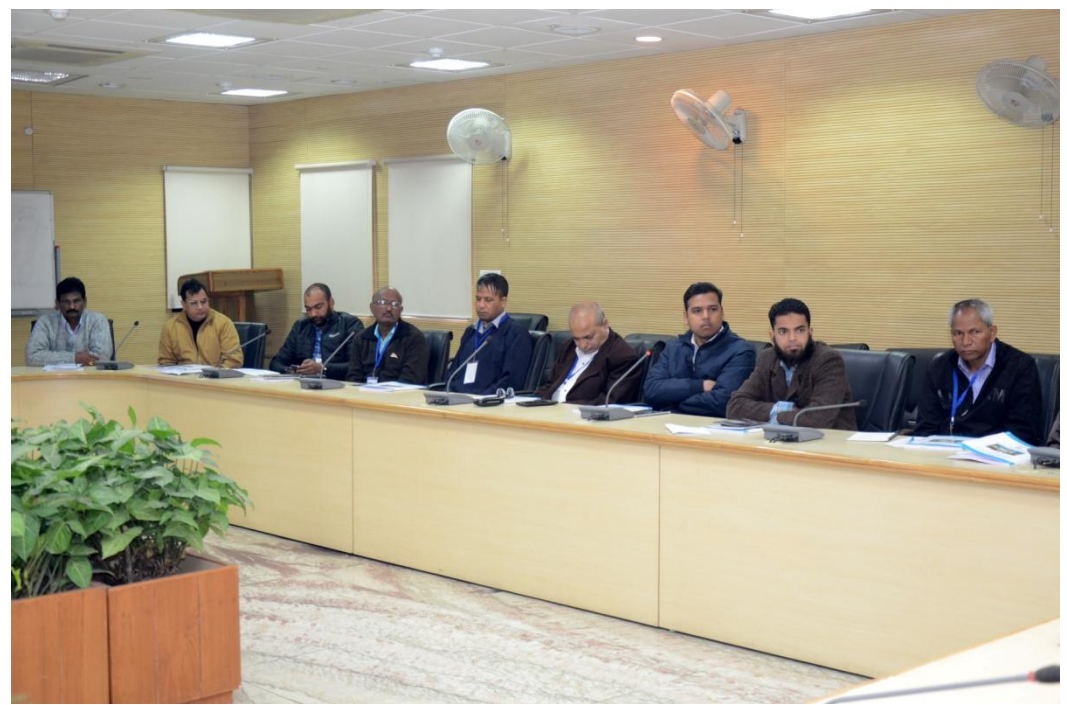
Participants of the Training Programme on Water Quality Monitoring of Surface, Ground, Waste Water / Effluent, Data Interpretation and Quality Assurance 11-13 Feb. 2019, Roorkee