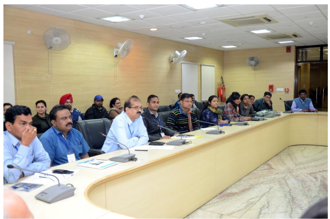
Participants in the Valedictory Function of the Training Programme on Water Quality Monitoring of Surface, Ground, Waste Water / Effluent, Data Interpretation and Quality Assurance, 11-13 Feb. 2019, Roorkee